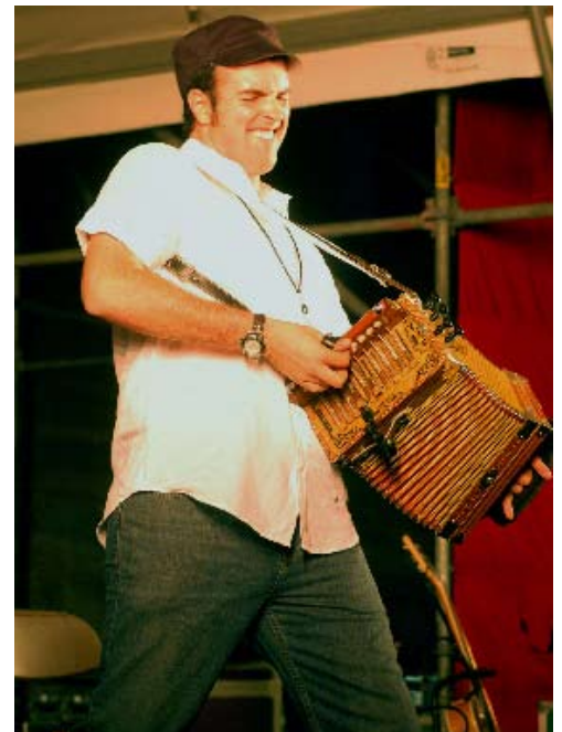
The Pine Leaf Boys