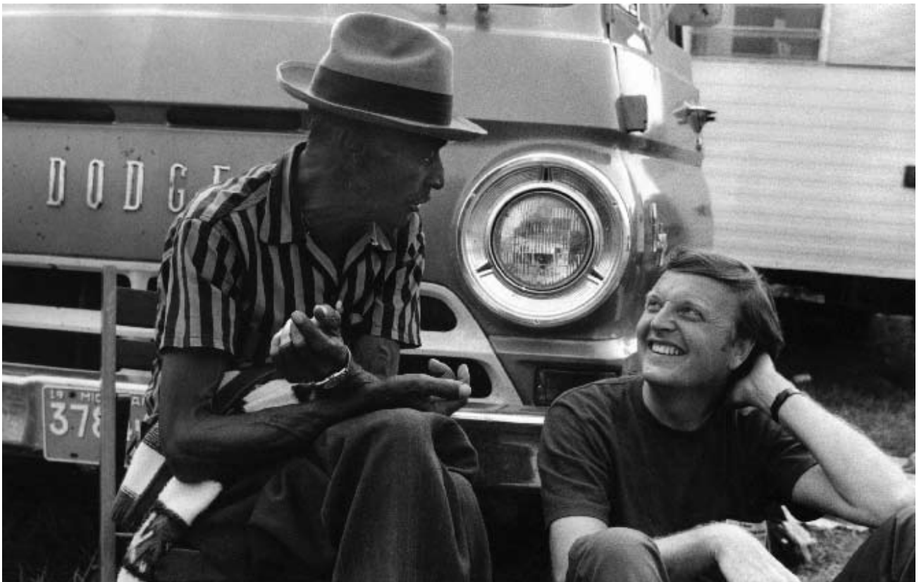
Mance Lipscomb and Chris Strachwitz, 1964

Strachwitz is the legendary founder of Arhoolie Records, the label that brought rural American music out of the shadows and into the limelight. He also brought rural musicians to Europe, introducing wildly enthusiastic audiences to the rhythms of bluesman Lightnin' Hopkins, Zydeco king Clifton Chenier and others. In the process, he changed music in the US – and the world - forever. From Texas to New Orleans, Cajun country to Appalachia, join Ry Cooder, Richard Thompson, Taj Mahal, Bonnie Raitt, Michael Doucet, the Pine Leaf Boys, Flaco Jiménez and the Treme Brass Band for a delightful hip-shaking romp, as Strachwitz continues his passionate quest for the musical soul of America.